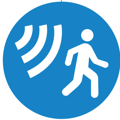
3rd Party Alarm System