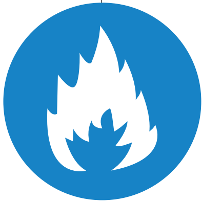
3rd Party Fire System