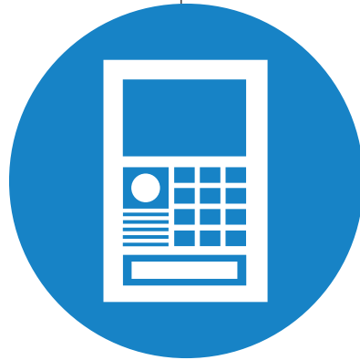
3rd Party Intercom System