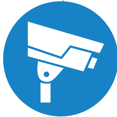
3rd Party Video System