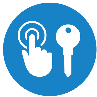
3rd Party Keys and Assets