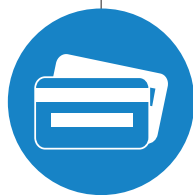
ASSA ARX Access Control System