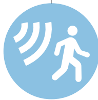
3rd Party Alarm System