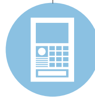
3rd Party Intercom System