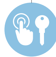
3rd Party Keys and Assets