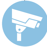
3rd Party Video System