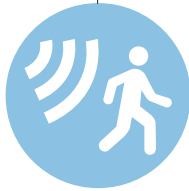
3rd Party Alarm System