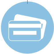
3rd Party Access Control System