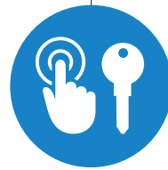
TRAKA Key Management